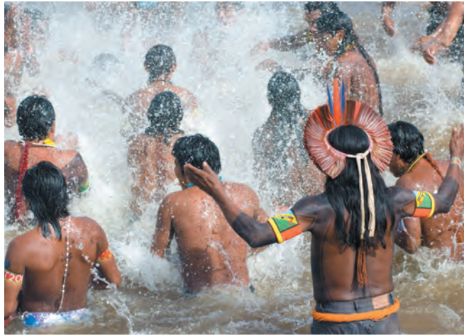
Kayapó warriors performing a traditional fishing practice.

Belo Monte is one of the world's most controversial dams, and indigenous peoples and social movements in the region have fought its construction for more than 20 years. In July 2009, a delegation of groups opposing the dam met