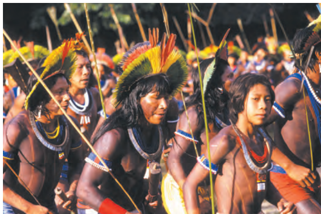
The Kayapó are opposed to the Belo Monte Dam.

Power lines would be built to connect Belo Monte with the central grid, meaning that the energy from Belo Monte could go nearly anywhere in Brazil. But it's most likely to go first to