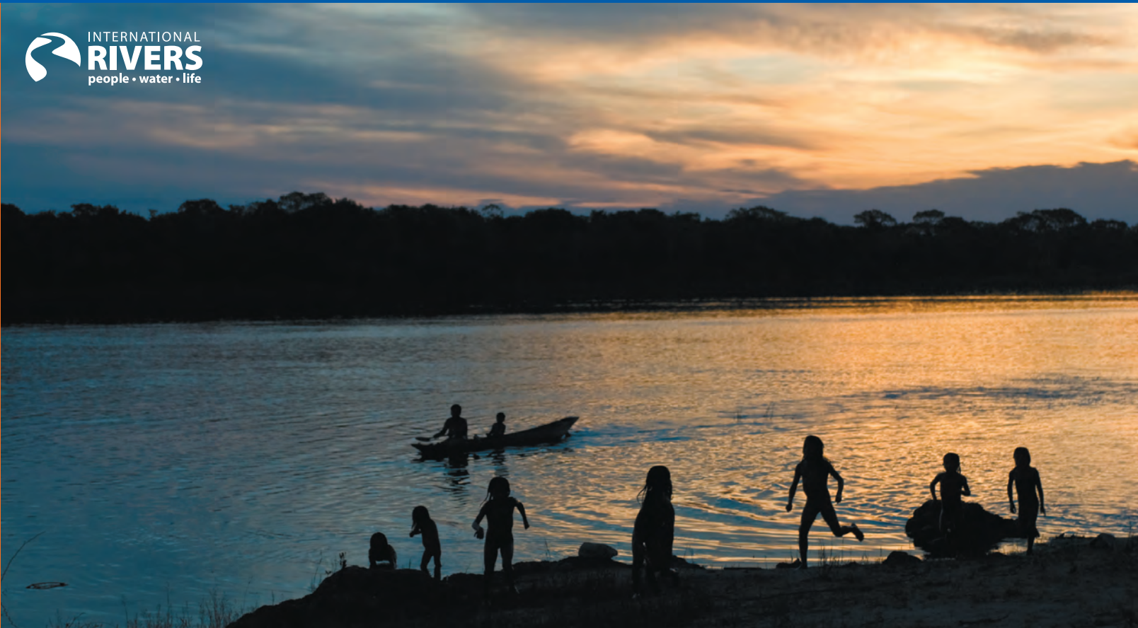
Children playing beside the Xingu River at sunset.